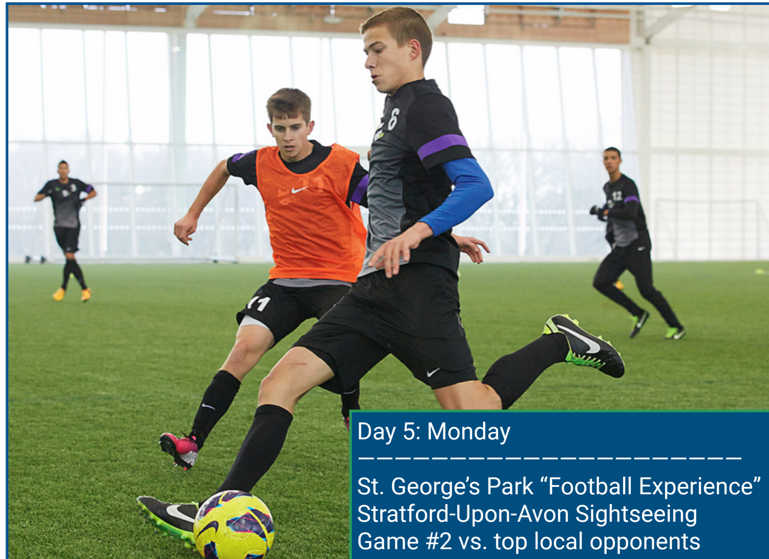
Day 5: Monday ----- St. George's Park "Football Experience" Stratford-Upon-Avon Sightseeing Game #2 vs. top local opponents