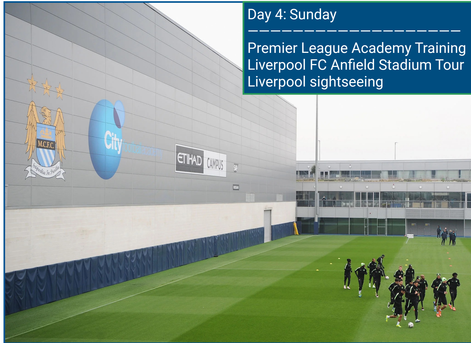
Day 4: Sunday ----- Premier League Academy Training Liverpool FC Anfield Stadium Tour Liverpool sightseeing