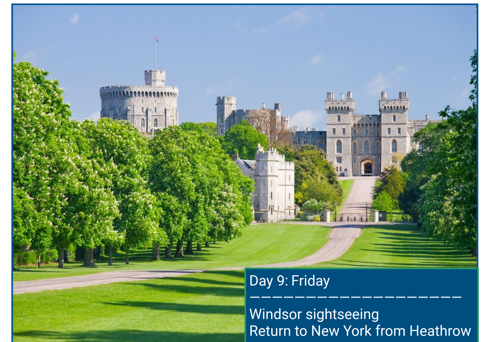
Day 9: Friday ----- Windsor sightseeing Return to New York from Heathrow