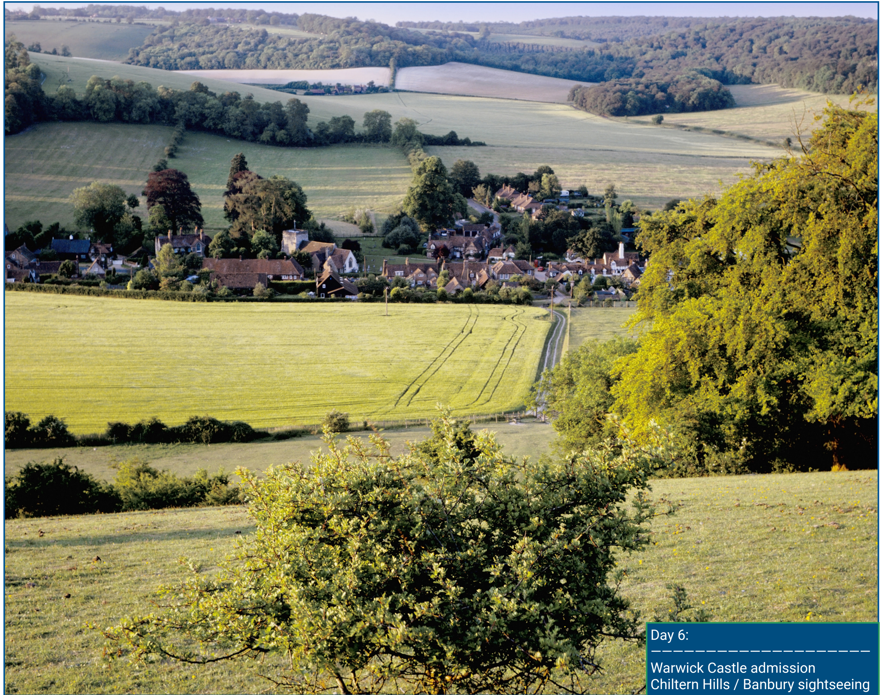
Day 6: ----- Warwick Castle admission Chiltern Hills / Banbury sightseeing