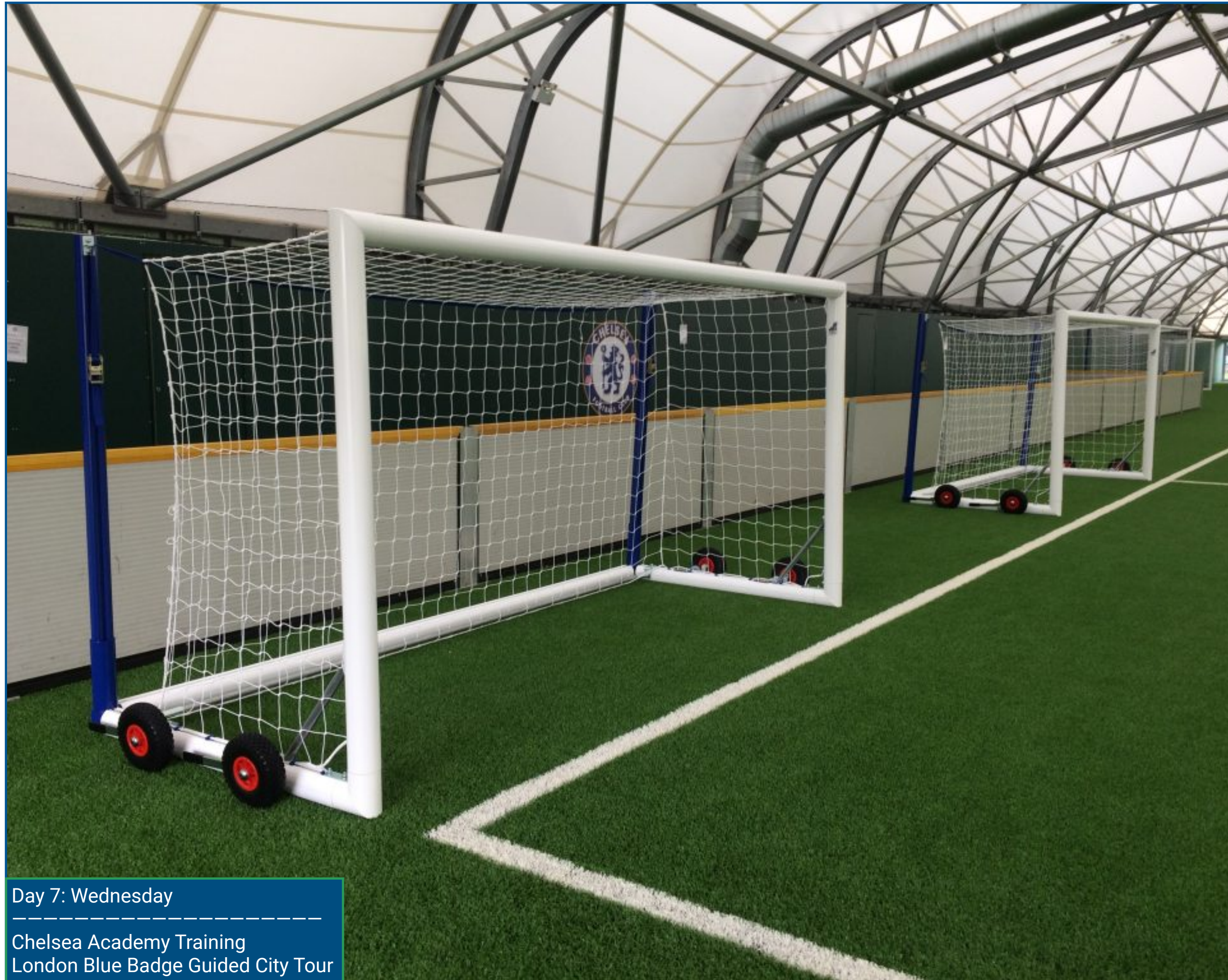
Day 7: Wednesday ----- Chelsea Academy Training London Blue Badge Guided City Tour