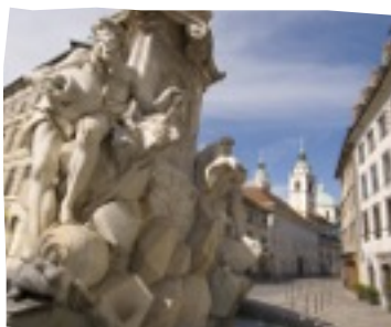
Robba Fountain, Ljubljana