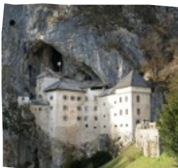
A fortified entrance to the Postojna caves