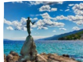
Monument in Opatija's harbor