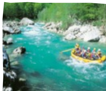
Rafting on a Slovenian river