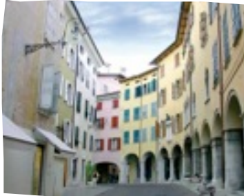
Traditional street in Udine