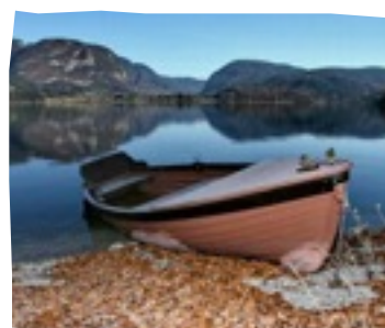
Lake Bohinj with Alpine backdrop