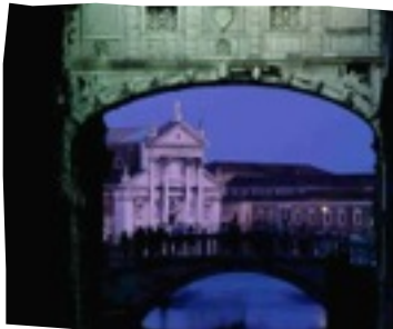
Dusk at the Bridge of Sighs