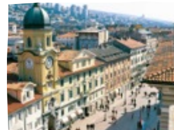
19th Century Rijeka