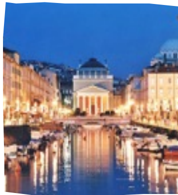
Piazza Ponterosso in Trieste