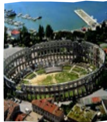
Pula's remarkable amphitheater