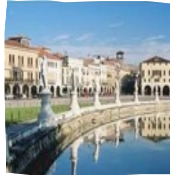
Padua's main square